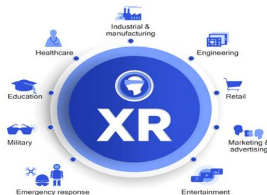
Figure 1. Application of XR in varies industries

To widely use XR technologies, a number of technical issues must be resolved. To display a rich visual material and to move between the real world and virtual world without any lag, XR needs more technological upgradation in display technology. It is incredibly difficult to make virtual objects in augmented environments that look exactly like real ones, especially in a variety of lighting situations. To that extent, XR needs to establish pervasive and ubiquitous connectivity to the internet and cloud services. The XR market is anticipated to grow to $200 billion by 2024, which is eight times where it is now. This enormous growth might indicate that the realities of human lives in 2030 are incomprehensible now.